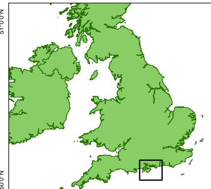
CHART D: DREDGING EXPLORATION AND OPTION AREAS FOR SOUTH COAST REGION CORRECT AS OF 31/01/2019

CEMEX UK Marine Ltd. (Tel. 023 8072 020)