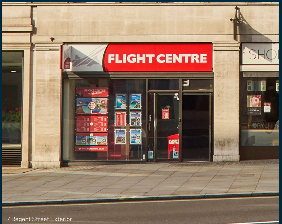
7 Regent Street Exterior